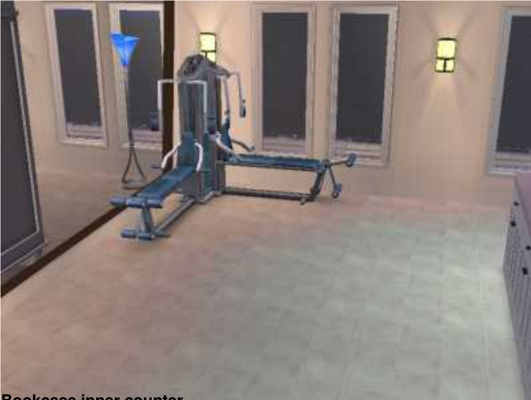
Bookcase inner counter