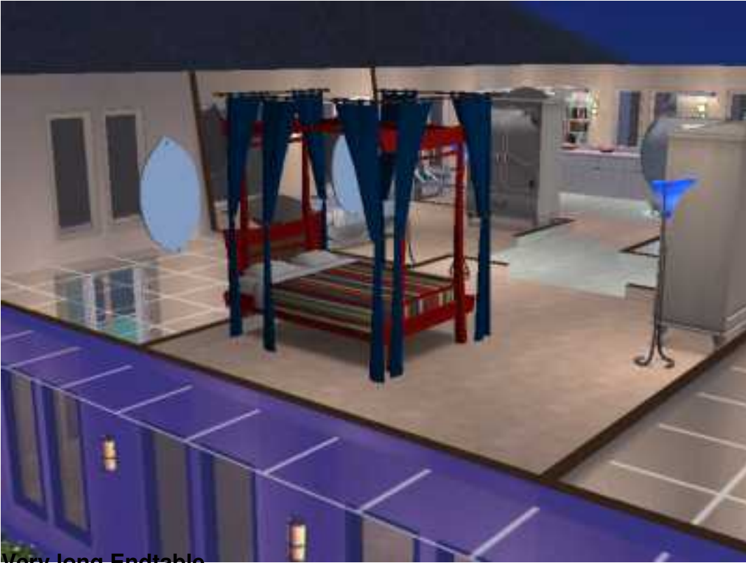
Very long Endtable